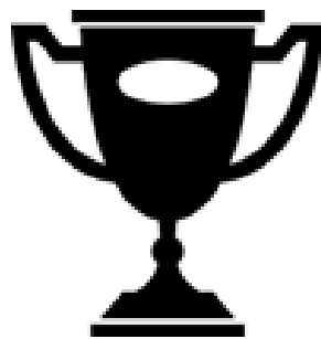
School Point Score Trophy